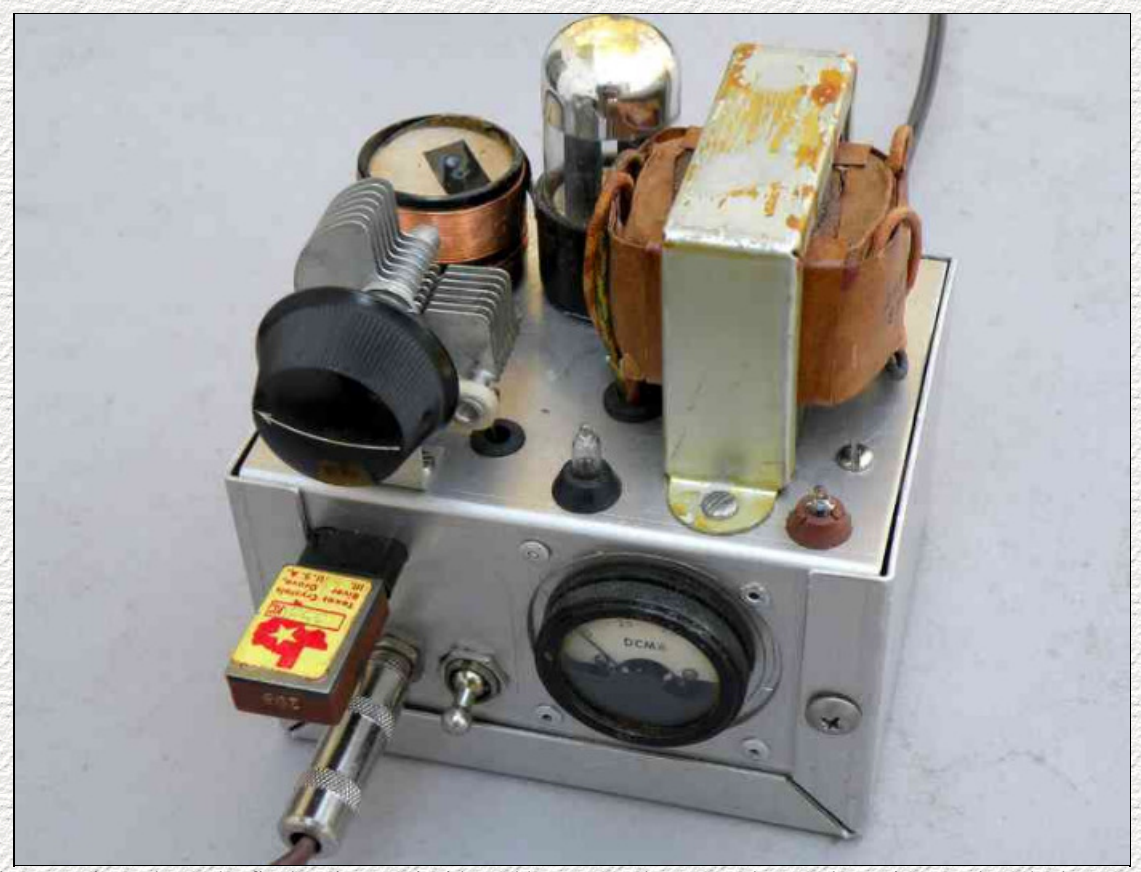
The black wrinkle transmitter places the final tuning cap inside and has B+ on that cap. It has a schematic pasted on the bottom of the chassis.

The transmitter with the meter is the older of the two. Its circuit is parallel feed to the final plate using an RF choke and a fixed cap to keep the B + voltage off the exposed final tuning cap on top of the chassis.