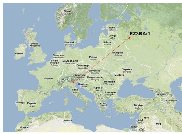
Fig.2 Left side: The world map with Moon and dx information. Right side: terrestrial map of RZ3BA/1